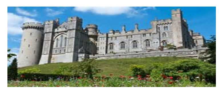
Parent Information Leaflet