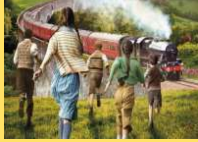
Year 5/6 Cinema Trip 17th November 2022 to watch The Railway Children Return

Year 3 Cinema Trip 18th November 2022 to watch The Croods 2