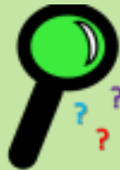
Source analysis and interpretation